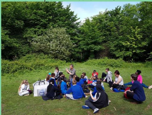
Refraction Project with Niddrie Mill PS

See here for the latest programme of activities.